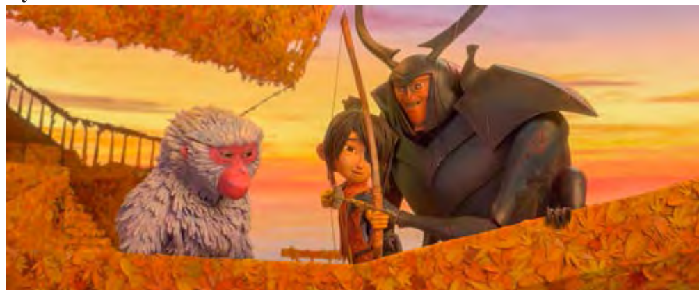
Monkey (voiced Charlize Theron) watches as Beetle (voiced by Matthew McConaughey) teaches Kubo (voiced by Art Parkinson) how to fish with a bow and arrow in animation studio Laika's epic action-adventure "Kubo and the Two Strings," a Focus Feature release.